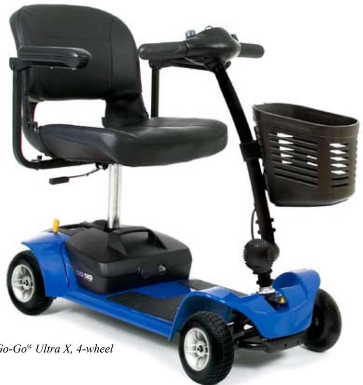
Go-Go ® Ultra X, 4-wheel