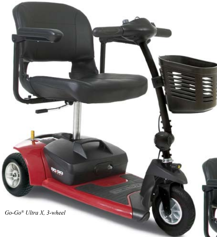
Go-Go ® Ultra X, 3-wheel

The Go-Go ® Ultra X is loaded with design features like one hand Feather-touch disassembly and a convenient drop-in battery box that makes transport and travel worry free. The Go-Go ® Ultra X delivers these features and more, along with the performance you expect from the first name in travel mobility, making it the ultimate travel scooter value.